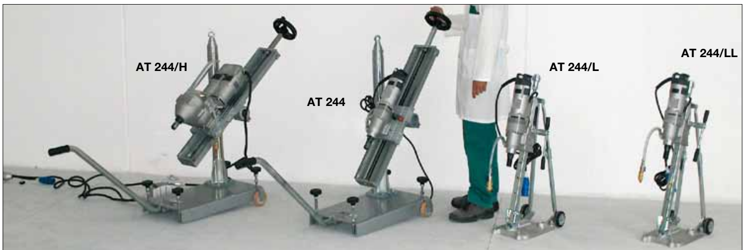
RANGE OF ELECTRIC MACHINES