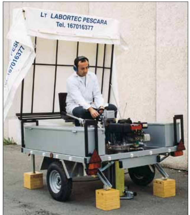
AT 247 - AT 247/C

May be supplied printed with client's logo at no extra charge.